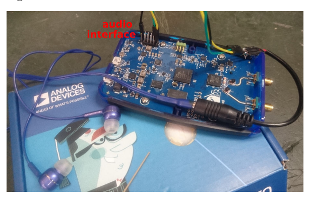
Figure 1: Adding an audio interface to the PlutoSDR through EMIO driven by a PWM added to the original bitstream. In this example, the PWM datapath is independent of the data stream coming from the AD9363 radiofrequency frontend providing the raw I/Q signals needed to demodulate a broadcast FM station and playing sound on the headphones.

In addition to providing the Buildroot framework to add custom software, including GNU Radio blocks, to the PlutoSDR, we provide the ability to tune the bitstream configuring the Zynq PL with custom processing blocks, such as a sound output, making the PlutoSDR a fully autonomous, embed-